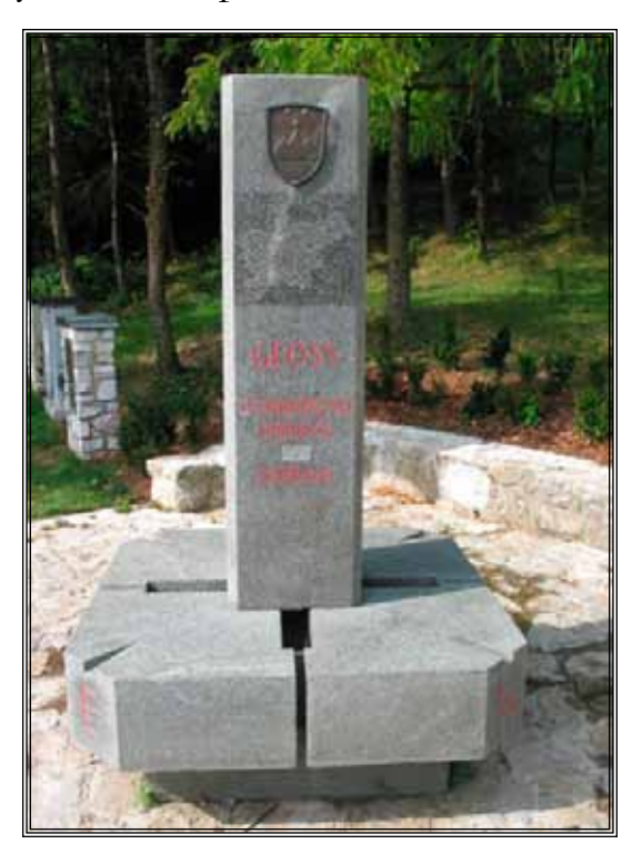
Obelisk at Geoss.

Located 36 Km from Ljubljana the town of Vače is a convenient and wonderful tourist destination, where you will be able to rest your eyes on archeological treasures and enjoy in theatre performances.